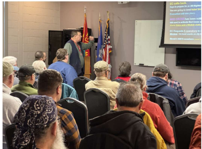
A capacity crowd fills the training room at Newington VFD Company #1.

Amateur radio operators are known for their desire and unique ability to provide public service through communications. Whether activated for a severe weather event or a local event such as a marathon or bike ride, the utility value and versatility of the Amateur Radio Service is enjoyed by communities around the country. One critical aspect of coordinating the communications is the role of net controller. These key volunteers bring order to chaos and flow to information. It is a specialized skill that requires development, practice, and training.