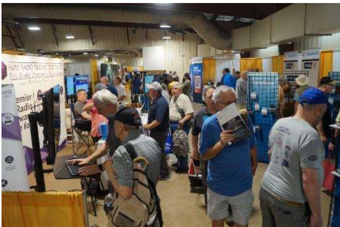
A very full East/West Hall. Hams eager to see the newest radios and ham related products.