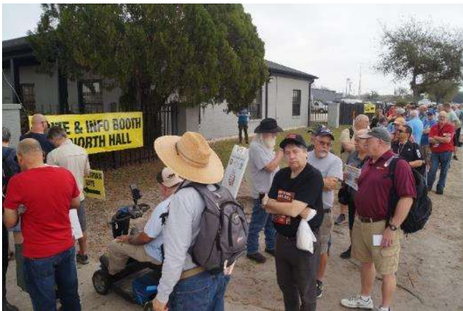
Before the HamCation gates opened at the East and South gates, long lines of ham radio operators were waiting to enter the show on Friday as well as on Saturday.